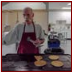
Annual Pancake Breakfast Fundraiser

Proud Sponsor of Bearden High School Key Club Fulton High School Key Club L&N STEM Academy Key Club