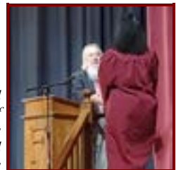
Annual Presentation of Service Awards to High School Seniors

We invite you to discover more about what we do. Join us on Wednesdays for lunch at The Foundry Visit https://www.northside-kiwanis.us/ E-mail us: info@northside-kiwanis.us